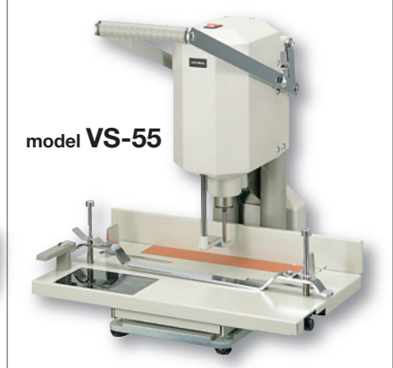
(Capacity: 580 sheets/64gm²)