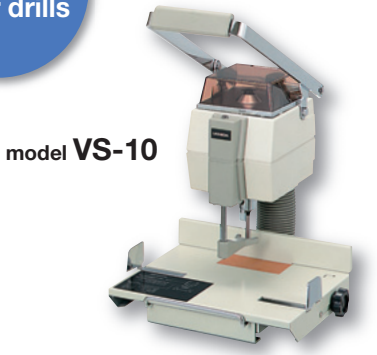
(Capacity: 350 sheets/64gm²)