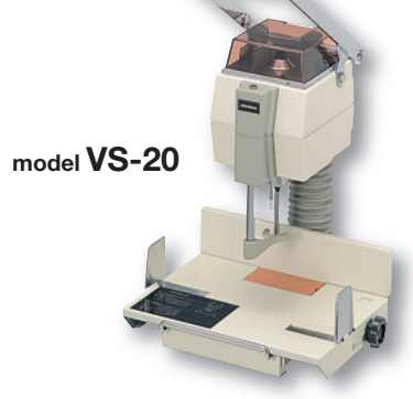
(Capacity: 580 sheets/64gm²)