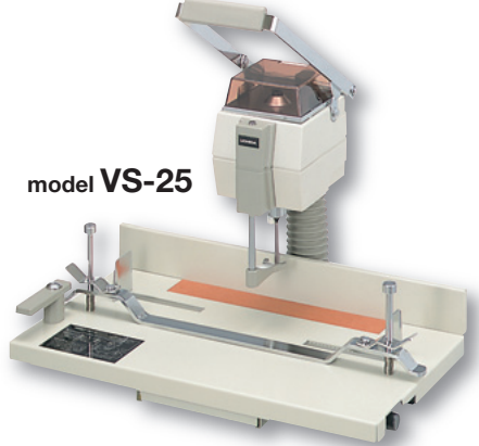
(Capacity: 580 sheets/64gm²)